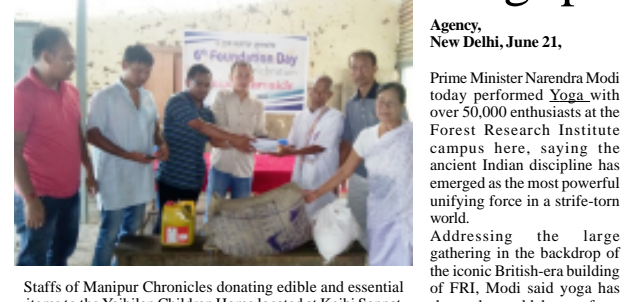
Staffs of Manipur Chronicles donating edible and essential items to the Yaibilen Children Home located at Keibi Sanpat in Imphal East district on occasion of its 6th Foundation day